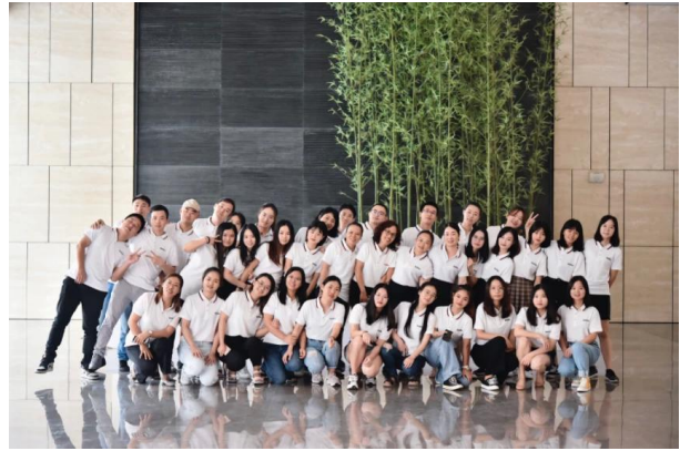
Sunny Worldwide Logistics Team