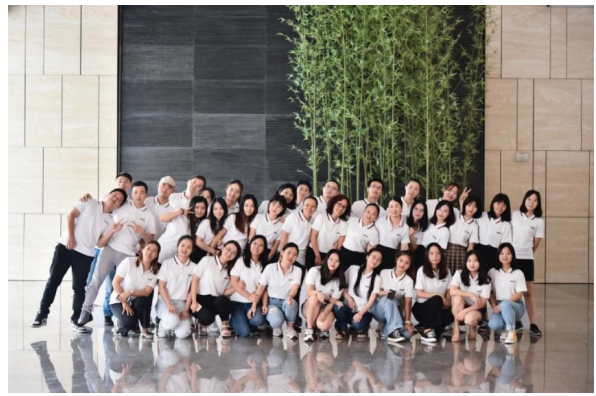
Hongmingda Logistics Team