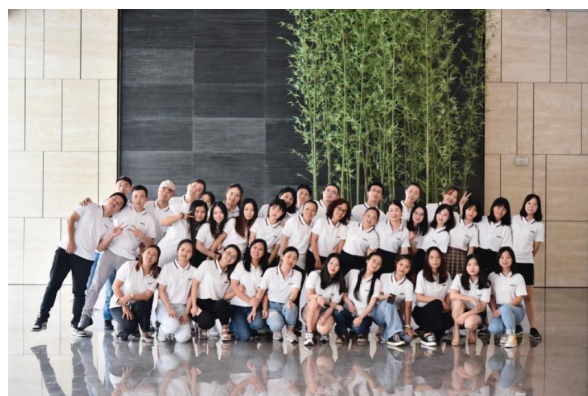
Hongmingda Logistics Team