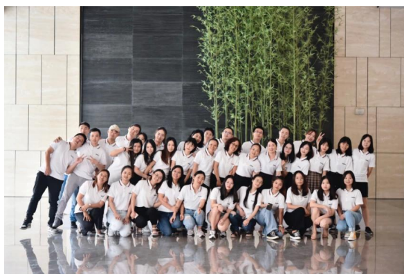
Sunny Worldwide Logistics Team